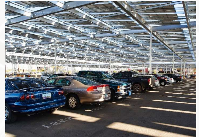
PowerShade® Auto & PowerParasol®